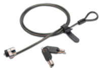
Kensington Microsaver Security Cable Lock by Lenovo (73P2582)