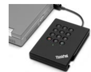
ThinkPad USB 2.0 Portable Secure Hard Drive 320GB (43R2019)