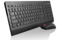
Lenovo Ultralim Plus Wireless Keyboard & Mouse (0A34032)