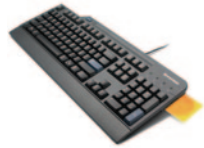
Lenovo USB Smartcard Keyboard (51J0155)