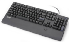
Lenovo Fingerprint USB Keyboard (73P4730)