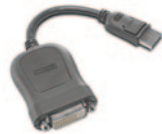
DisplayPort to Single-Link DVI-D Monitor Cable (45J7915)