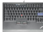
ThinkPad USB Keyboard with TrackPoint - U.S. English (55Y9003)