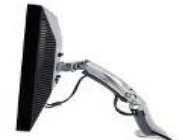
Ergotron MX Desk Mount Arm (78Y2317) Ergotron PN: 45-214-026 Ergotron MX Wall Mount Arm (78Y2318) Ergotron PN: 45-228-026