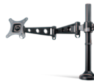
ThinkCentre Extend Arm (57Y4352)